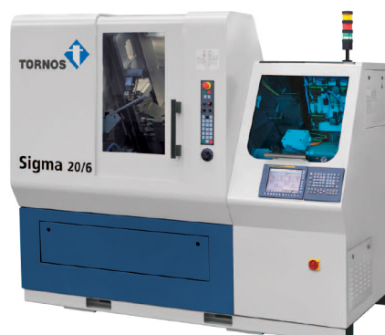
TORNOS SIGMA 20

High productivity thanks to machining with two tools up to a diameter of 300 mm